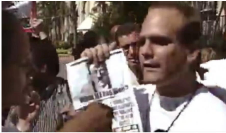
A flyer distributed at the WCAR with a picture of Hitler and the text "What if I had won?".

Screenshot from a video shared by UN Watch.